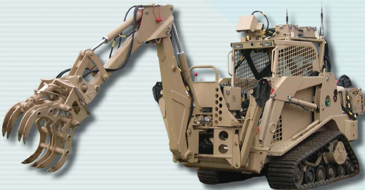
MRCS installed on an ASV RC-50